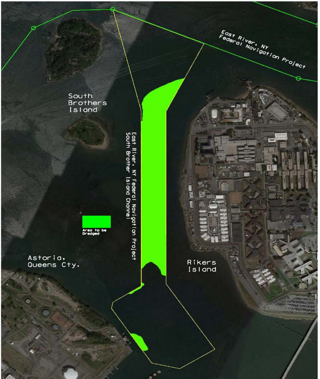
FIGURE NO. 1